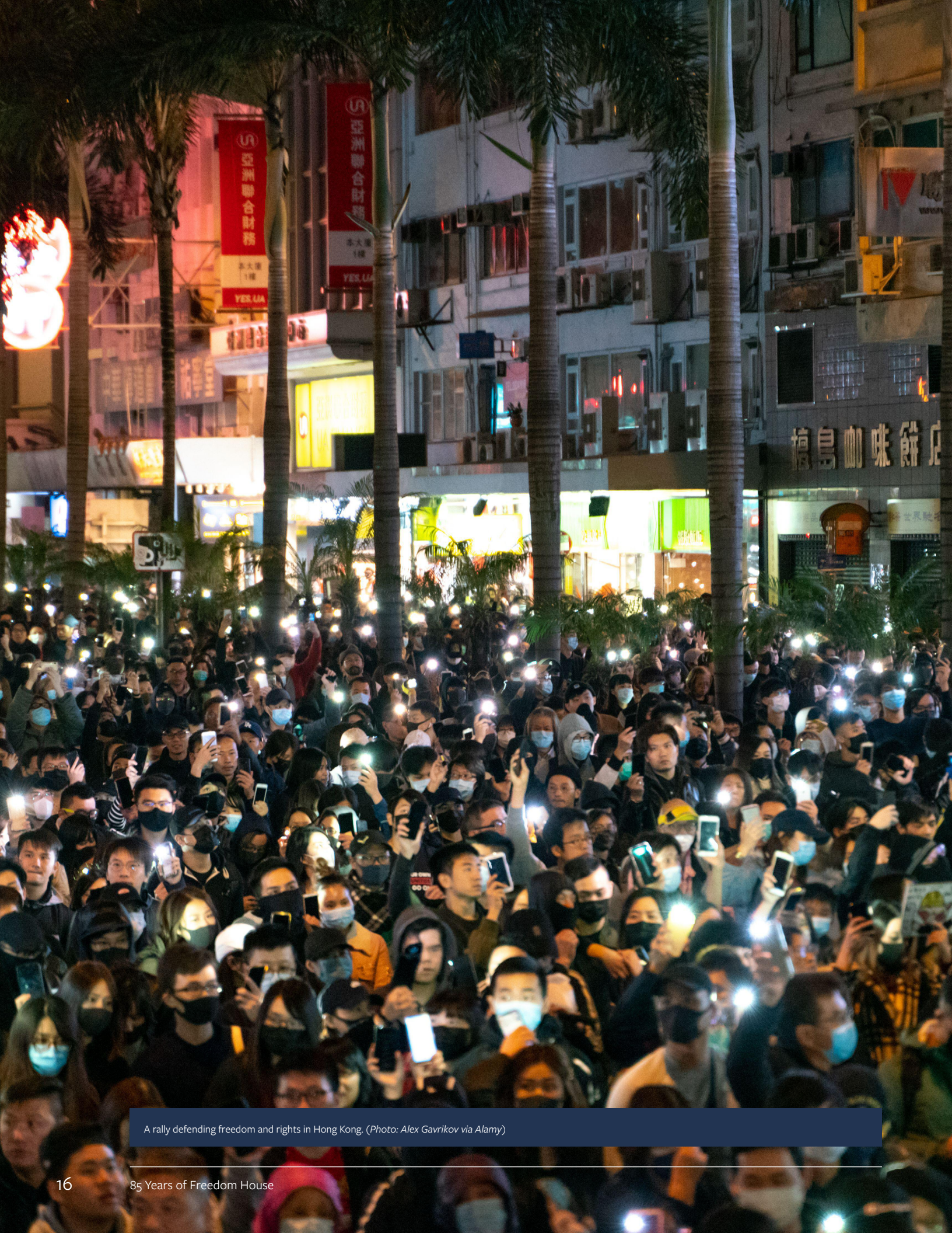
A rally defending freedom and rights in Hong Kong.