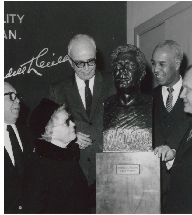
RIGHT: A bust of Wendell Willkie is unveiled at Freedom House on the 75th anniversary of his birth. Roy Wilkins, executive director of the NAACP, attended and praised Willkie as “one of the first political crusaders in this country to declare forthrightly for equality.”