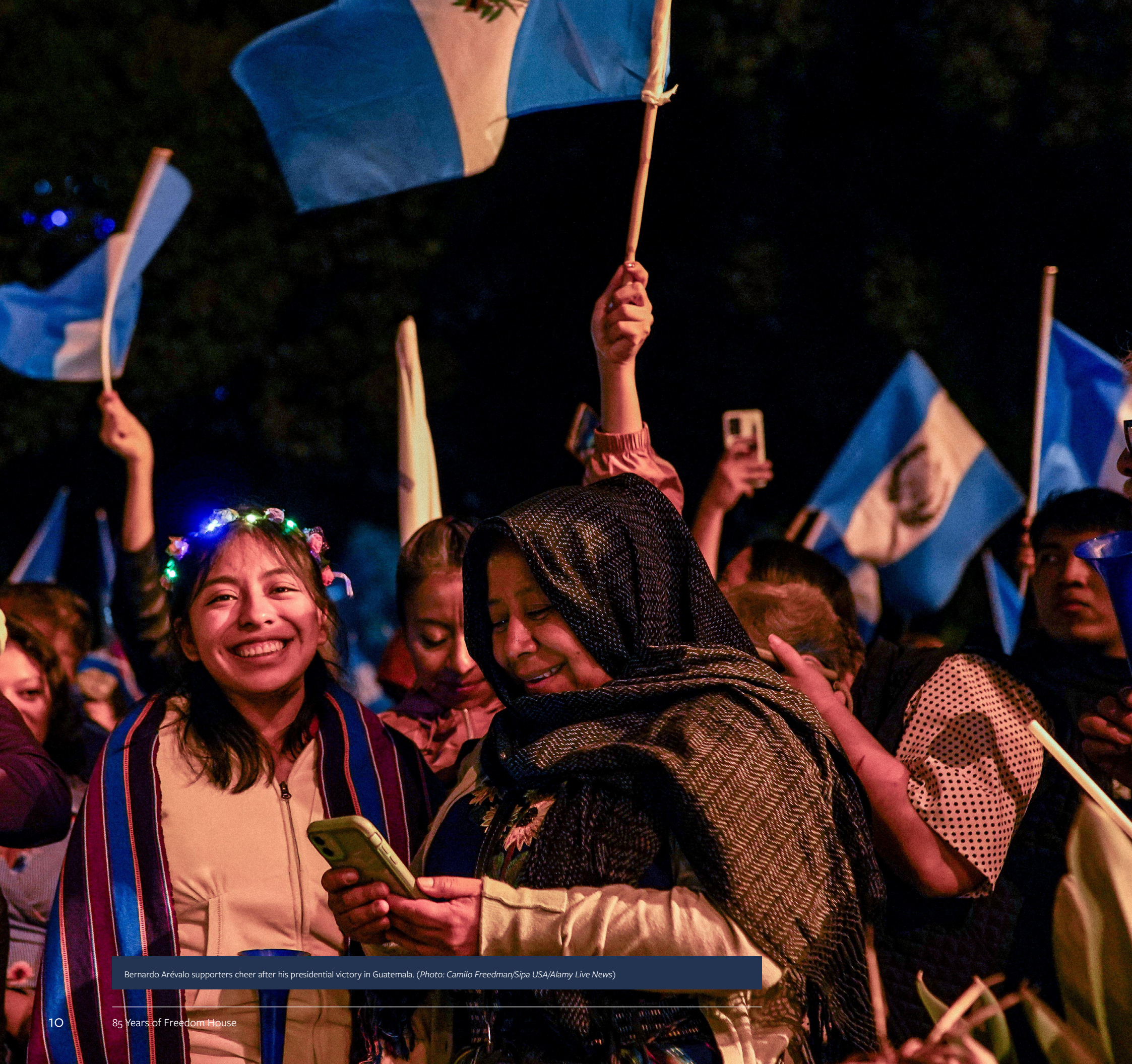
Bernardo Arévalo supporters cheer after his presidential victory in Guatemala.