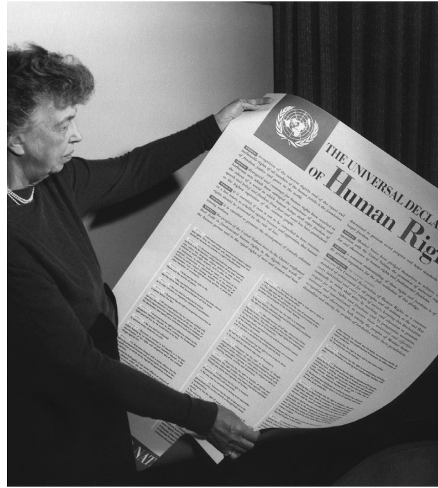
LEFT: Eleanor Roosevelt holds a copy of the Universal Declaration of Human Rights.