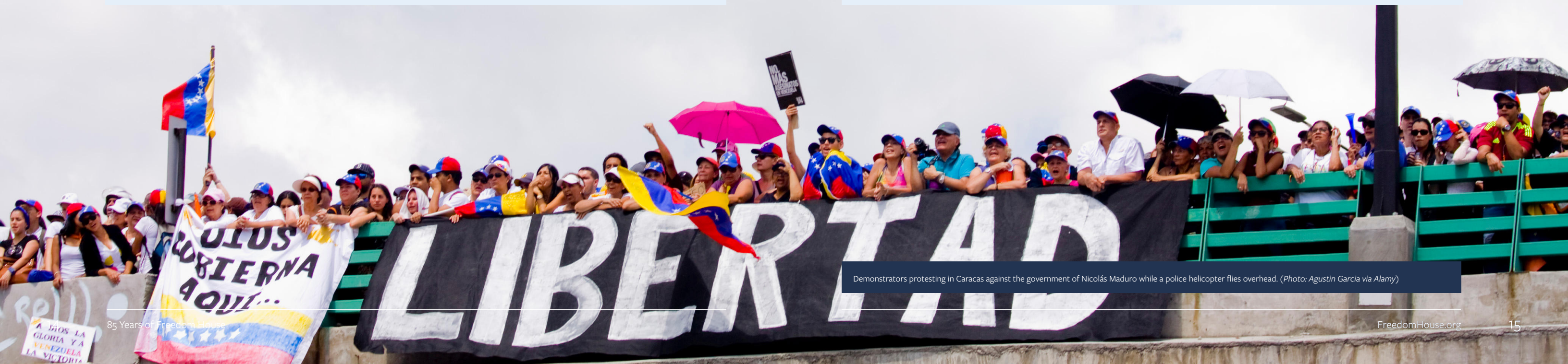
Demonstrators protesting in Caracas against the government of Nicolás Maduro while a police helicopter flies overhead.

Religious communities—from Christians in China to Bahá'í in Iran to Muslims in Myanmar—face grave abuses worldwide. Since 2025, Freedom House has addressed more than 96 instances of religious persecution and assisted 396 persecuted individuals across 14 countries and diverse faith communities. Expanding this work offers a compelling opportunity for donors motivated by faith, conscience, and the universal right to worship freely—or not at all.