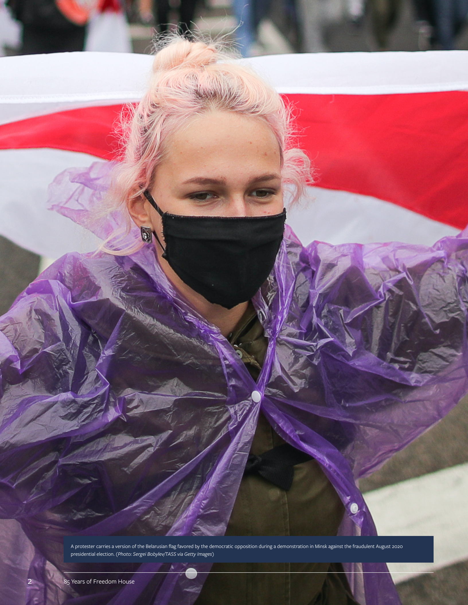
A protester carries a version of the Belarusian flag favored by the democratic opposition during a demonstration in Minsk against the fraudulent August 2020 presidential election.